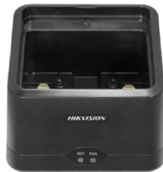
Battery Charger DS-MH1490